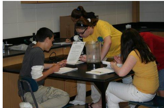
Springport Middle School science lab.