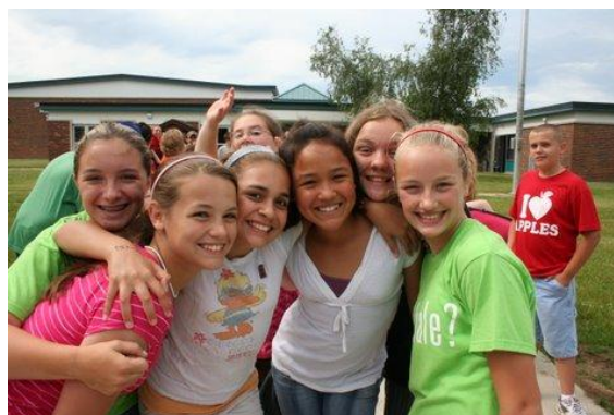
SMS scored an A on the 2007-08 AYP, this is accredited to a commitment from students, parents, and faculty.