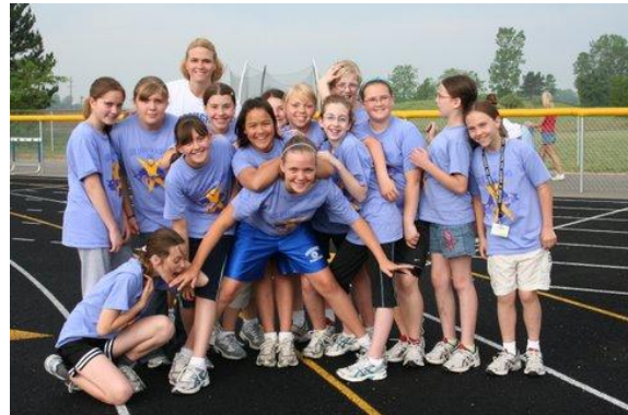
Springport Middle School Girls Quest