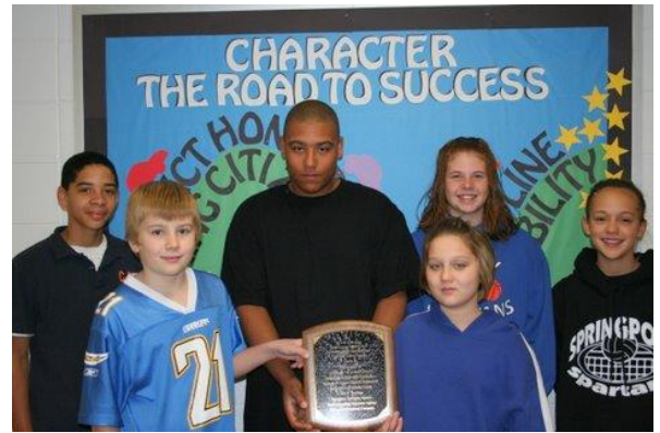
Springport Middle School Character Education.