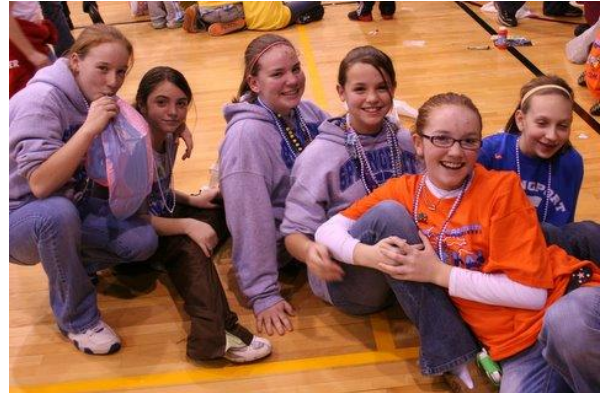
Springport Middle School students involved in a school-wide assembly.