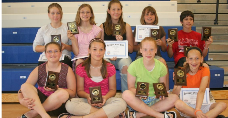
Springport Middle School 6th Grade Award winners.