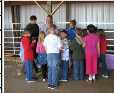
Students have an opportunity to learn in the Agriscience facilities.