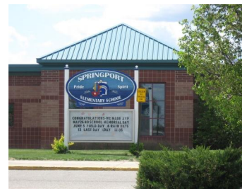
The Elementary is open to students from pre-school to grade 5. The school day is from 8:30 am—3:30 pm.

Elementary School with broad knowledge, self-confidence, and an enthusiasm for learning. We will strive in partnership with home and community to educate and motivate students to be productive and achieve their potential.