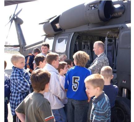
The Elementary Career Show is a big hit, especially when a Black Hawk helicopter lands on school grounds.

Springport Elementary made Adequate Yearly Progress in 2008 based on the State of Michigan standards. The composite grade for the elementary was a B.