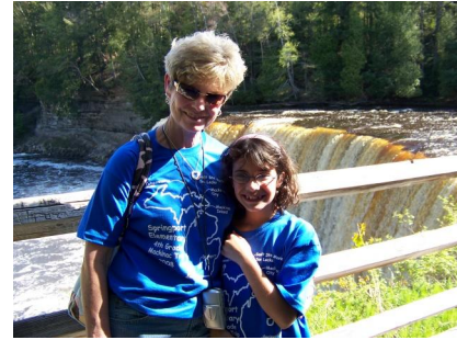
Parent involvement in field trips is encouraged. This picture of Tahquamenon Falls is from the 4th grade Mackinac Trip.