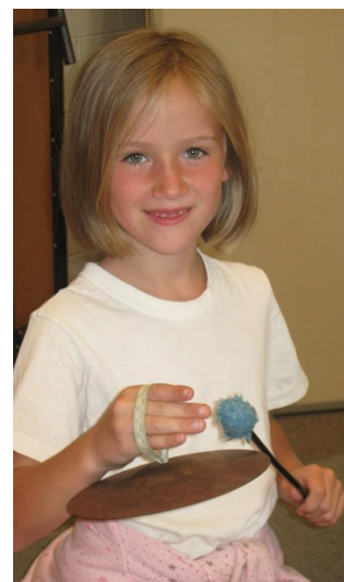
Springport Elementary students have the opportunity to explore music and the arts.

We believe Our mission is to provide a quality education for all students.