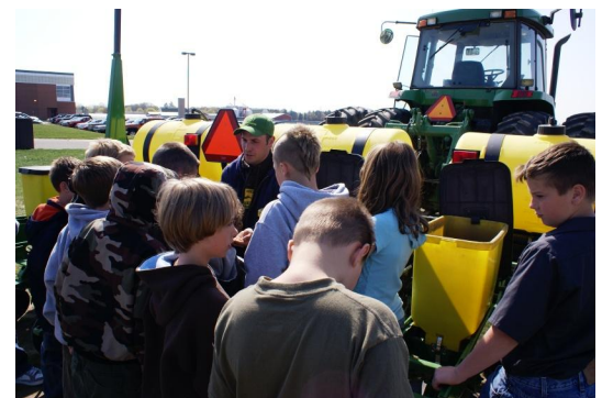
All students are exposed to a variety of exciting careers at Career Day hosted in the spring.