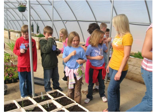
Learning about Nutrition education not only takes place in the classroom; students also get to learn in a greenhouse and school gardens.