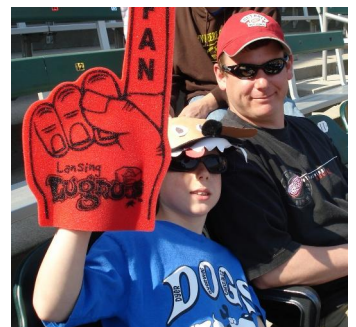
Students and parents attended a Lansing Lugnuts game this last year.

Thank you for your commitment to the students and community of Springport.