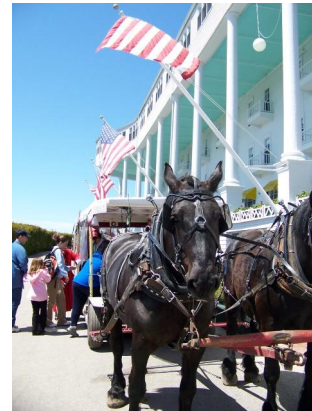
The 4th Grade Mackinac Trip is a highlight of the school year for many students.