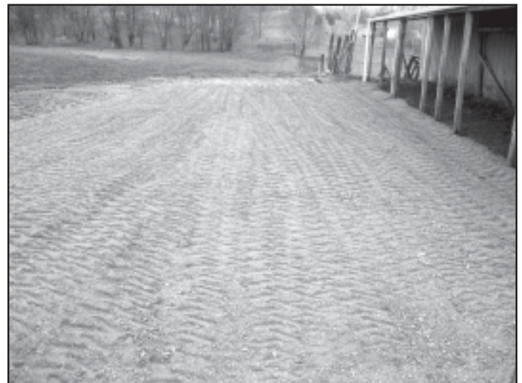
Manure was scraped off of site, #60 Geo cloth was laid and covered with 5" of compacted stone.