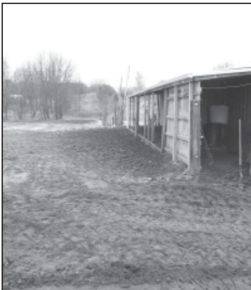
Before picture of the heavy use area protection.